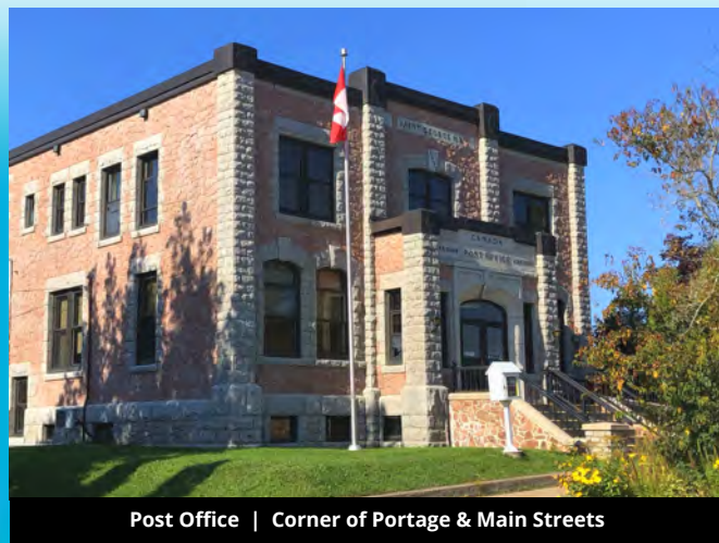
Post Office | Corner of Portage & Main Streets