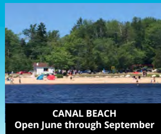
CANAL BEACH Open June through September