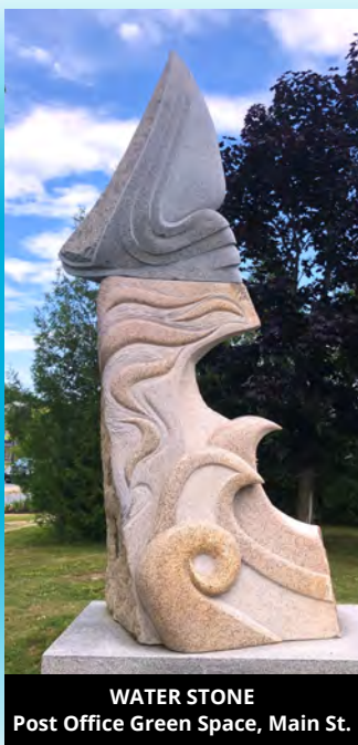
WATER STONE Post Office Green Space, Main St.