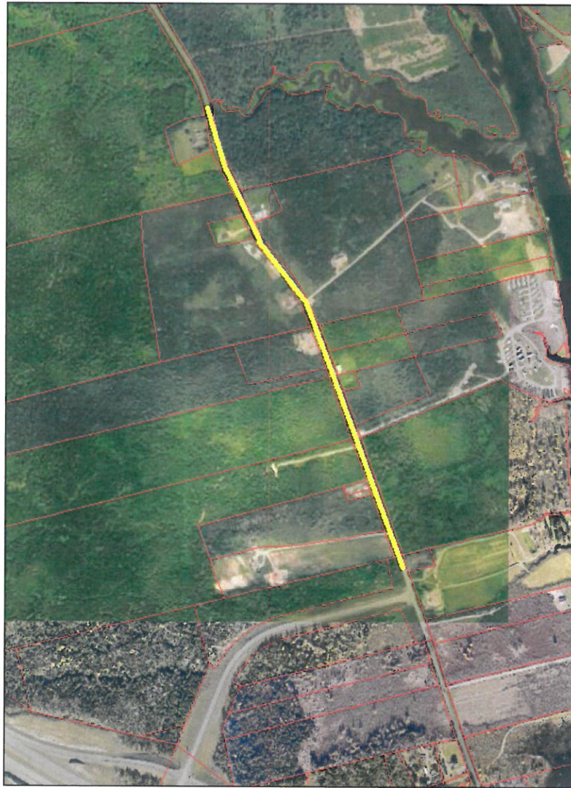
All-Terrain Vehicle (ATV) Route – St. George Manor Road