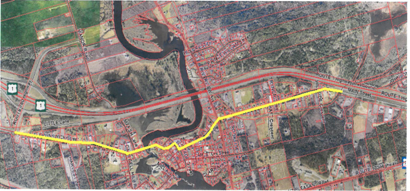
All-Terrain Vehicle (ATV) Route – St. George Main – Portage – Wallace – Brunswick