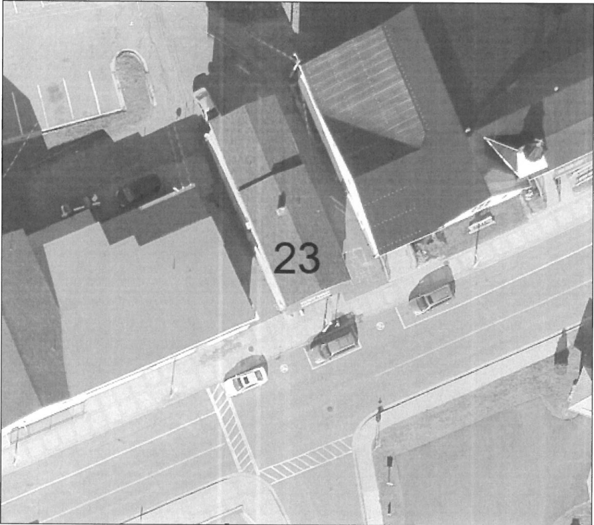
Figure D.1 - 23 Main Street, aerial view.