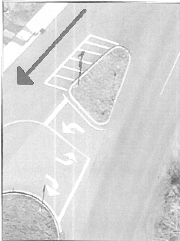
Figure C.1 – Intersection of Mascarene Road/L'Etete Road and Fundy Bay Drive