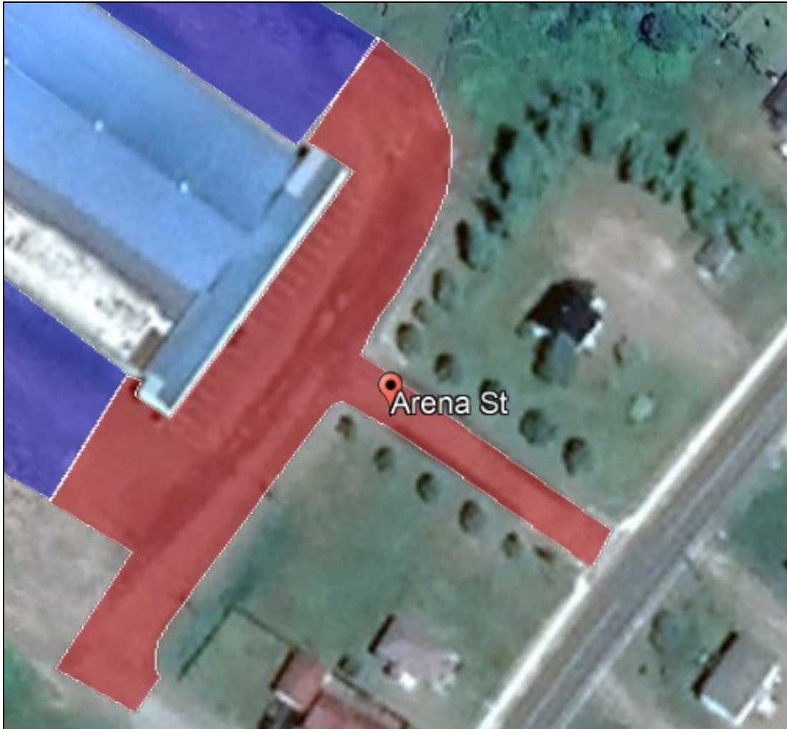
Paving Area (red)